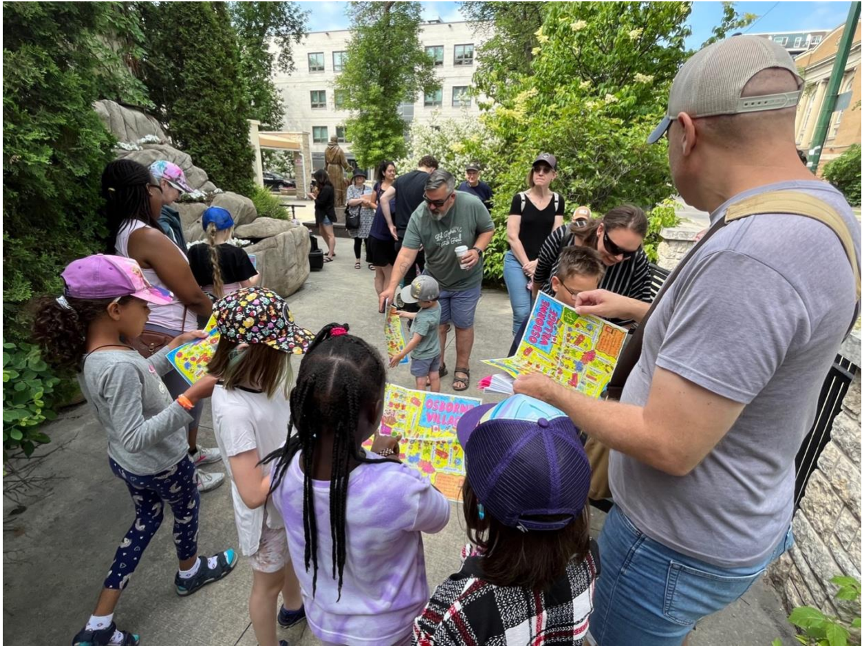
Figure 1: Osborne Village Kids Tour

The tour programme was produced with support from the Province of Manitoba, The Winnipeg Foundation, the City of Winnipeg, and the Manitoba Association of Architects.