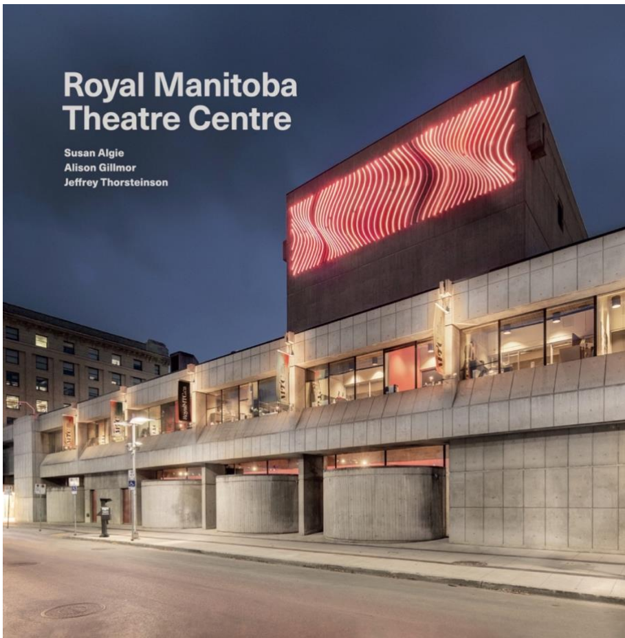
Figure 5: Royal Manitoba Theatre Centre book cover.