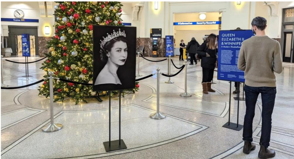
Figure 2 - Queen Elizabeth II & Winnipeg on display at Union Station.

Produced with support from the Department of Canadian Heritage.